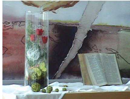
Altar in Lahr, Russian Worship

tion. This image is so often used for pastors I was a little taken back. He went on to explain that there was only one shepherd—the