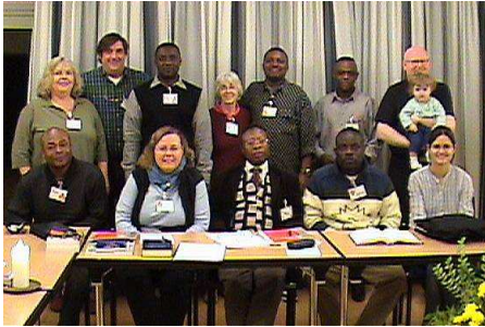
Fall Lay Speakers Class 2008

Four participants came from Berlin, five from Düsseldorf and three from Stuttgart. Six were from International congregations and six from Ghanaian congregations.